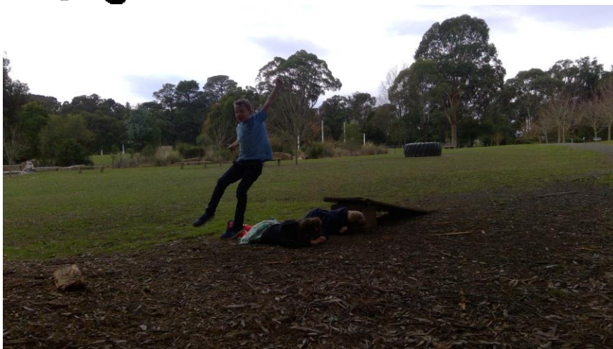
Some of our students experimenting with 'risk'!

Inquirers, Knowledgeable, Thinkers, Communicators, Principled, Open minded, Caring, Risk Takers, Balanced and Reflective